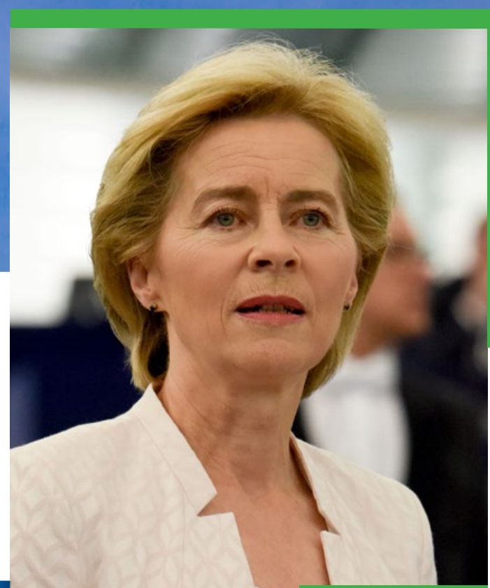
Ursula von der Leyen

This chart outlines the policy commitments given by members of the von der Leyen Commission during their European Parliament hearings, so you can evaluate their progress in matching words with actions over the Commission's five-year mandate.